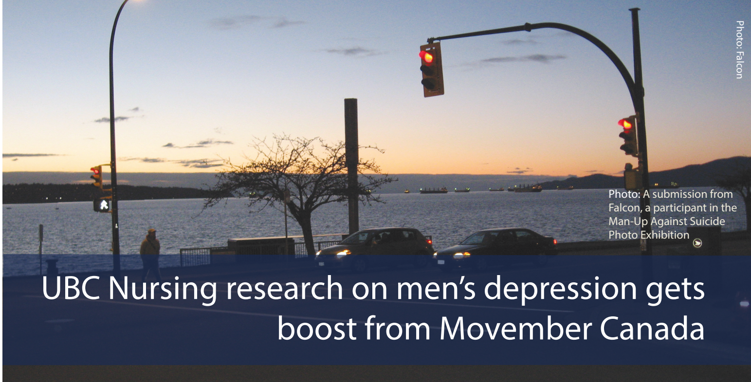
Photo: A submission from Falcon, a participant in the Man-Up Against Suicide Photo Exhibition