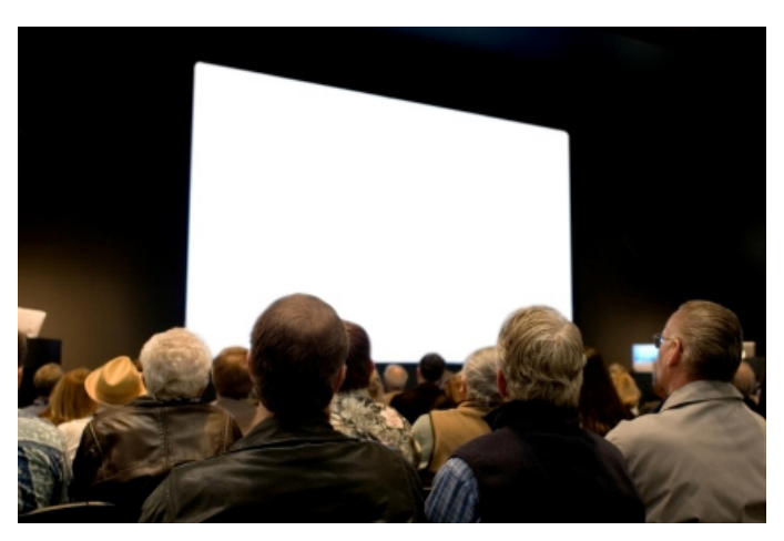
The study findings about PCSG sustainability are available in more detail at:

PCSG sustainability was also influenced by linkages with professional organizations. One option for the PCSGs in this study was to affiliate with cancer fundraising agencies. However, concerns were expressed by some PCSG attendees that the groups would end up working for organizations that dictated the terms and conditions under which they operated. Many PCSGs were resistant to anything resembling a "takeover" or "branding" by organizations that did not have the capacity to provide resources to the groups and willingness to negotiate mutually acceptable terms of operation.