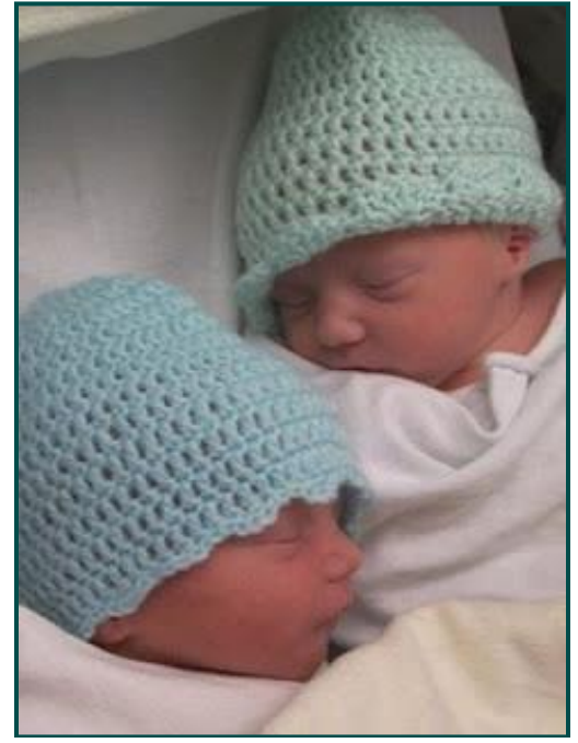
One hour old http://allaboutcutybabies.blogspot.ca/2009/07/new-born-twins.html

www.nursing.ubc.ca/pdfs/twinstripletsandmore.pdf