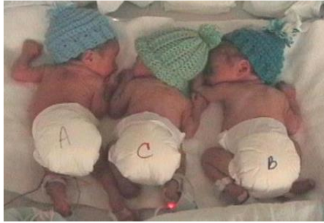
Newly Born http://multiples.about.com/od/picturesphotos/ig/Triplet-Photo-Gallery