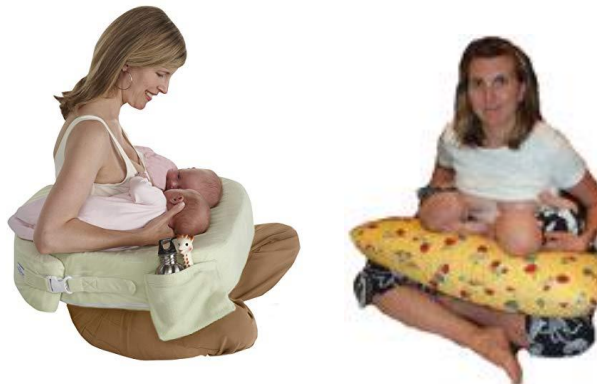
My Brest Friend Twins Plus Nursing Pillow

Sources: Maternity/baby stores, Online businesses. Used pillows: multiples' groups, For sale Ads.