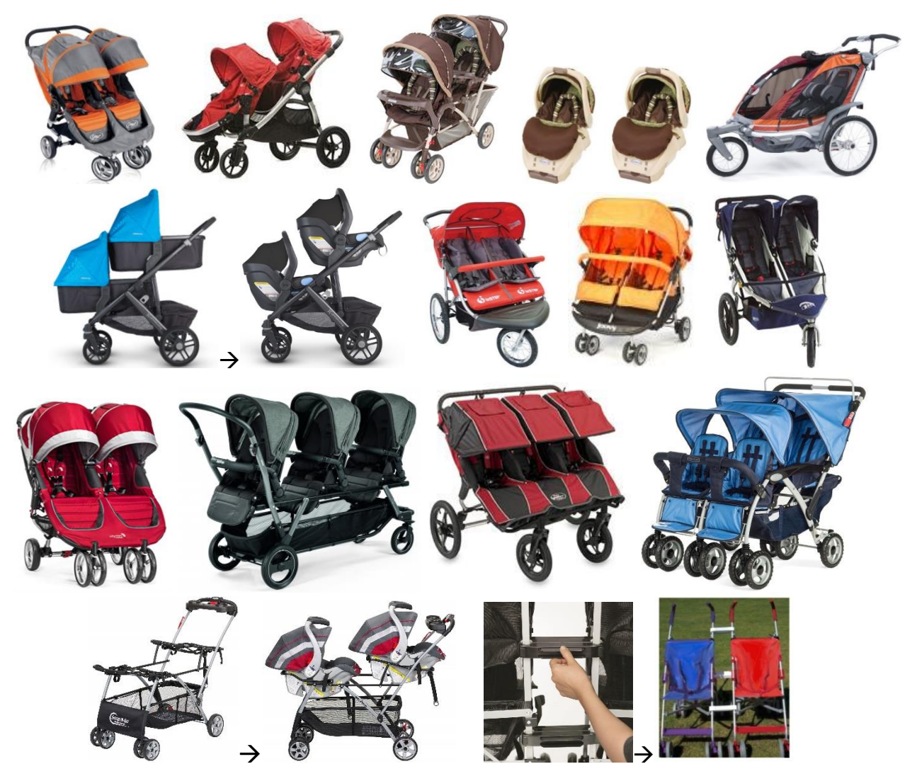
Twins, Triplets & More! www.nursing.ubc.ca/pdfs/twinstripletsandmore.pdf March 2020 10/39

Some models have reclining seats, convert into different positions or have detachable bassinets and/or car seats that can also be used as baby carriers. The Double Snap-N-Go frame accepts certain car seats (bottom L). Stroller connectors join two <u>identical</u> single umbrella strollers (bottom R) -- follow safety-installation instructions. Examples of manufacturers: Baby Jogger, BOB, Mountain Buggy (Duet), Peg-Pérego (Duette), Chariot, UPPA Baby, Ingelsina, Graco, InSTEP, Maclaren, Schwinn, Valco, Bugaboo, Bumbleride, Britax, Joovy, Chicco, etc.