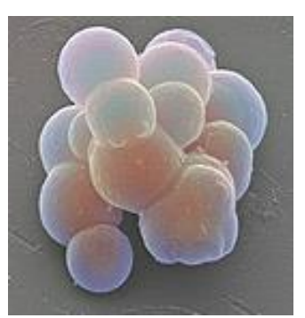
Blood stem cells taken from an umbilical cord after delivery. http://nature.ca/genome/03/d/20/03d_25_e.cfm

The umbilical cord blood of a newborn contains a high concentration of stem cells – the building blocks of human organs, tissues and cells. Stem cells are capable of regenerating tissues and hold promise for treating serious diseases and injuries. During pregnancy, discuss with your health care providers the advantages and drawbacks of saving the umbilical cord blood at the birth of each of your babies and then banking it with a private agency. Check out companies' qualifications and the cost.